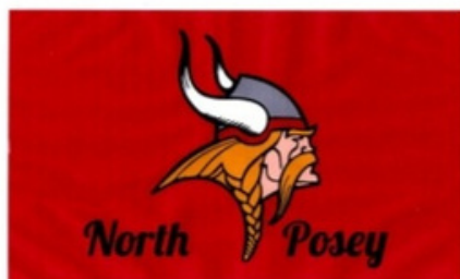
3'x5' red flag with black writing