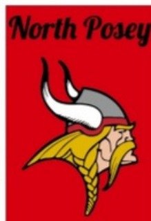
12"x18" red garden flag with black writing